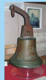
From "Georgette" sunk near Redgate 1876