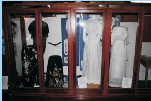
A selection of our clothing display