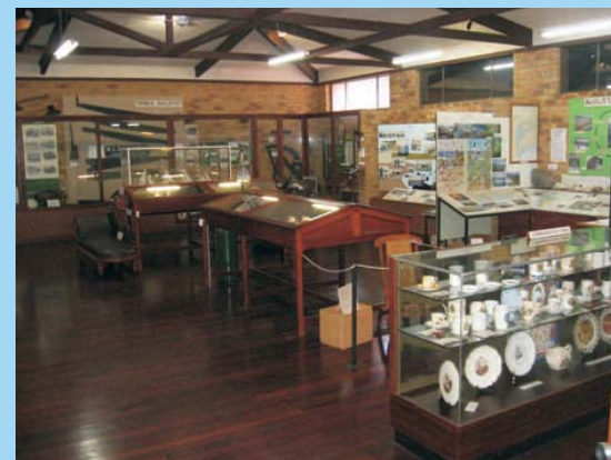
The Extensive Watson Gallery