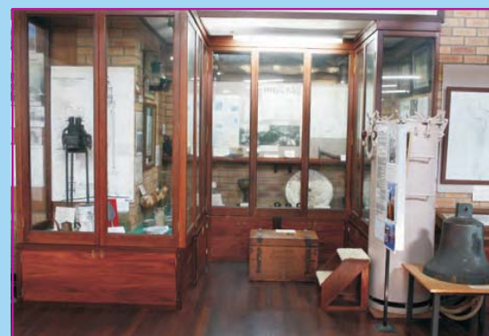
Part of the fascinating Shipwreck Display

Printed with support from The Shire of Augusta-Margaret River