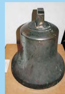
From "Pericles" sunk of Cape Leeuwin 1910